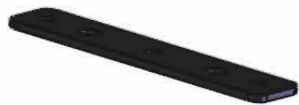
PS082 x 6