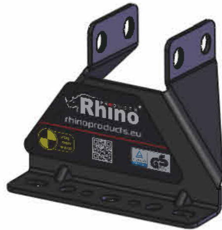
MS168 x 4