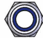
FN006 (M8) x 12