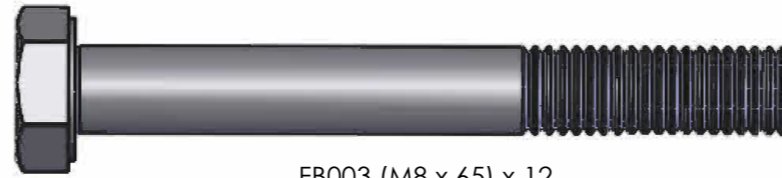
FB003 (M8 x 65) x 12