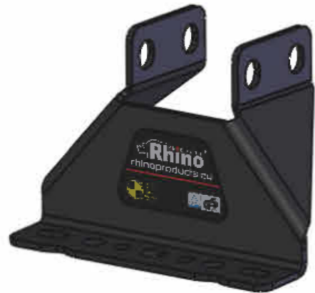
MS199 x 2