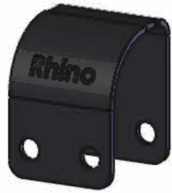
MS201 x 6